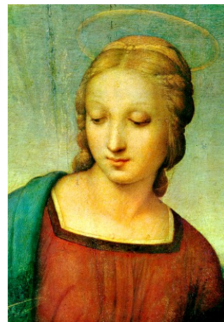
Image reference: http://www.jericojourneys.com/images/virginmary.jpg